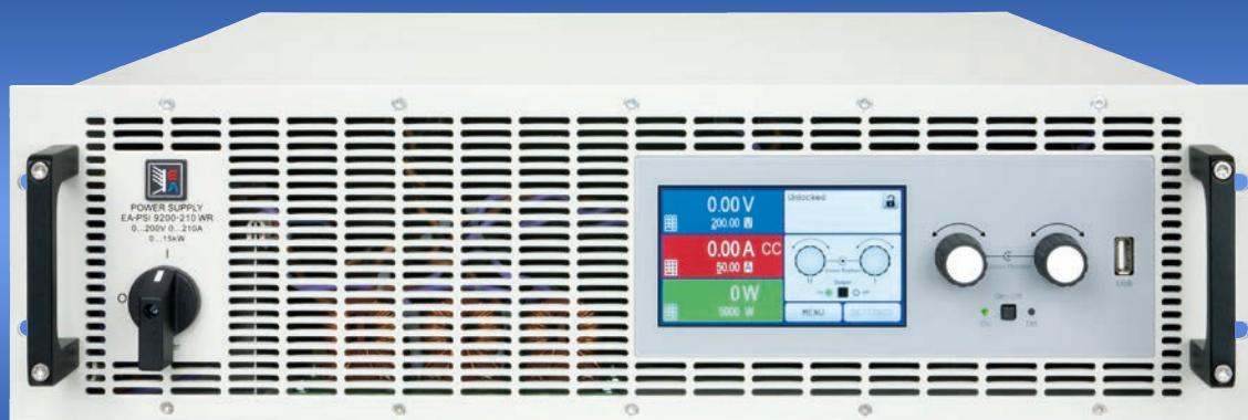
EA-PSI 9200-210 WR 3U

High efficiency DC Power supplies with extended AC input range